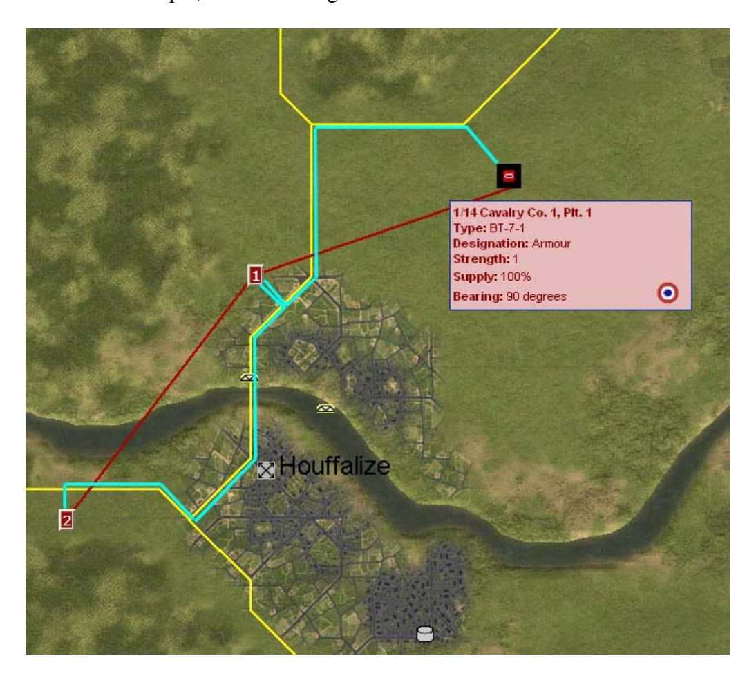
Figure 3: Ground Movement in CGM Relaxed Mode

Here is an example, taken from Figure 2.