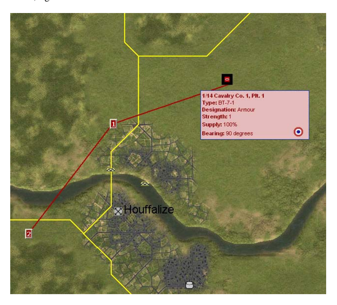
Figure 2: Ground Movement in CGM Simple Mode

Here's an example, set near Houffalize in the Ardennes map (Figure 2). Defined roads are rendered as solid yellow lines. The Allied commander has selected a BT-7 platoon and issued 2 commander waypoints, intending the tank to move from the north-east to the south-west of the picture, crossing the river between the first and second waypoints. In CGM Simple Mode, the tank platoon will follow the red lines directly from waypoint to waypoint, ignoring rivers, forests, roads and bridges. Not very realistic, but it is Simple Mode, right?